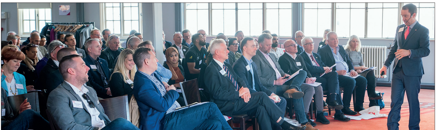
A face-to-face session at a BNI Surrey training event.

with range from multinationals to start-ups, but the majority are looking at what they can do to reduce their impact on the planet. It’s been a slow burn for many companies but as we now know just from watching the news, doing nothing is no longer an option. The CREST Awards provides an opportunity to shine a light on companies that are already making a difference and to inspire companies who are beginning their journey.”