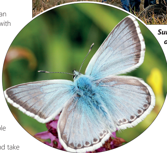
The Chalkhill Blue butterfly can be found on sunny, chalk grassland sites in Surrey.