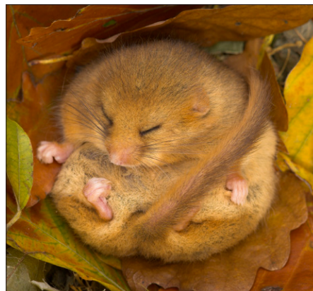
A hibernating dormouse, pictured by wildlife photographer Danny Green. Dormice are at risk due to the lack of proper long-term woodland and hedgerow management.