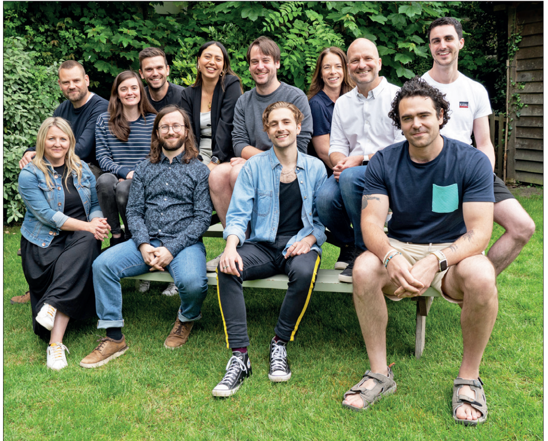
The award-winning DreamingFish team inspire with creative video and animation.