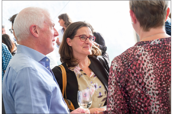
Business people during a networking event at Surrey Research Park, a University of Surrey Enterprise.

The institute was founded in 2022, with the aim of increasing the scale and enhancing the excellence of the University's research and innovation in priority areas.