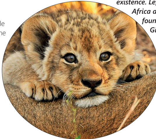
Left – Lions once roamed throughout all of Africa and parts of Asia and Europe but are now found only in sub-Saharan Africa and in India's Gir National Park.

together, we all have the power to make a real difference, says WWF. The Peoples Plan for Nature is a unique collaboration powered by the WWF, the RSPB and National Trust created for the people, by the people of the UK.