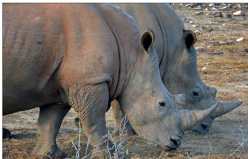
Relentless poaching for their horns and loss of their natural habitats, has led to a catastrophic fall in black rhino numbers.

It sets a vision for the future of nature, and the actions we must all take to protect and restore it. – that's why WWF UK is sponsoring the CREST23 Restoring Nature Award