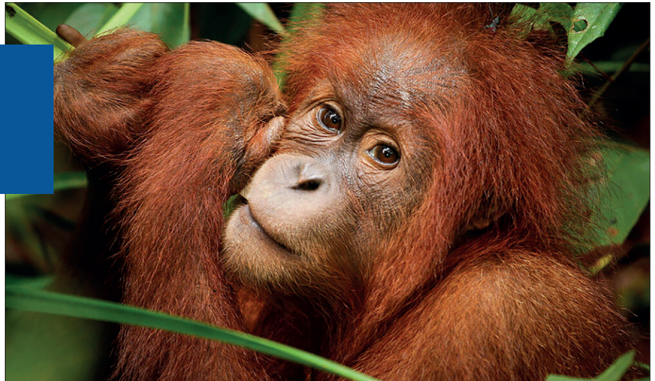
Above – Habitat loss causes food shortages for orangutans, our largest arboreal mammal. It's also reducing the size of the lowland forests in which they live a solitary existence.