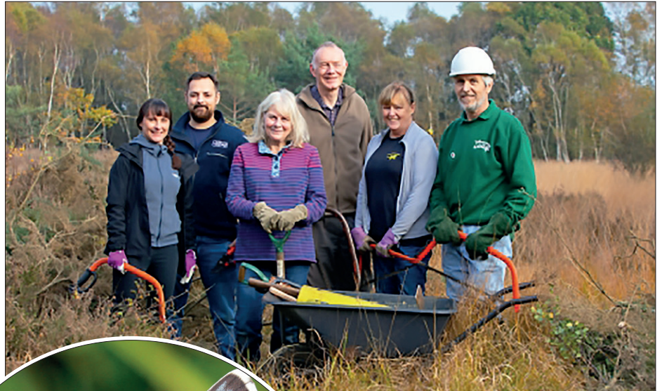
Surrey Wildlife Trust volunteers working on a heathland nature reserve.

For more information about how to support the trust and its work, visit www.surreywildlifetrust.org/support-us .